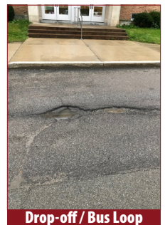
Drop-off / Bus Loop