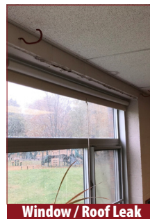
Window / Roof Leak