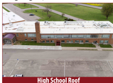
High School Roof