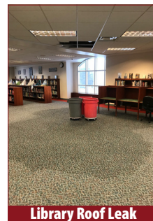
Library Roof Leak