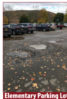
Elementary Parking Lot