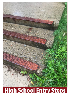
High School Entry Steps