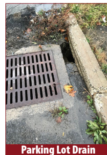
Parking Lot Drain