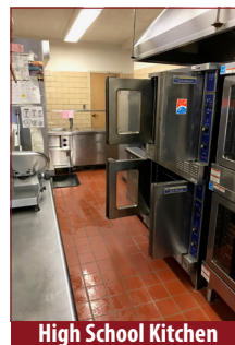
High School Kitchen