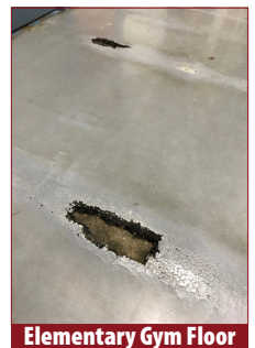
Elementary Gym Floor