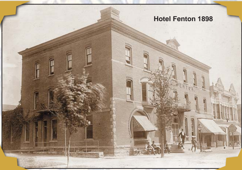
Hotel Fenton 1898

In 1961, Dekdebrun's Ski Shop was located in the basement. There have been a number of different bars and restaurants located on the first floor over the years with the most recent Foster's Pub . Over the past 20 plus years it has been known as the Ellicottville Inn and is currently undergoing renovation.