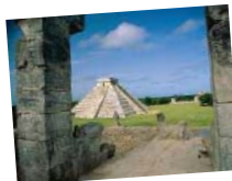
This is a picture of Chichén Itza.

their unusual shape for a reason also. The tops were flat not only because they used them for human sacrifice, but also because the Mayans used them for their religion.