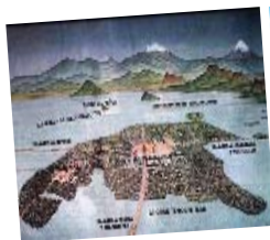
This is a picture of Tenochtitlan

The traditional architecture of México is built with bricks of sun-dried pecina , or mud called adobe . Along with the mud, grass is added for strength. When building,